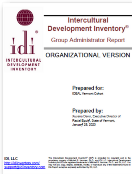
The IDEAL cohort's group profile